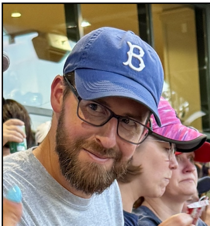
Did y'all miss me?

They are blessings to our church. Both have true hearts for ministry.