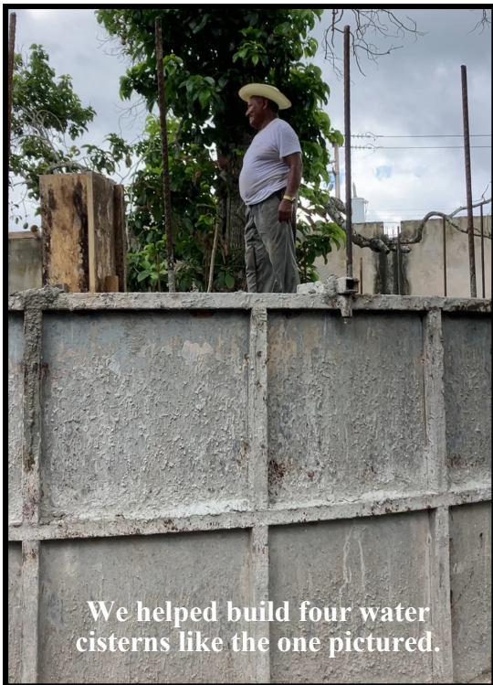
We helped build four water cisterns like the one pictured.