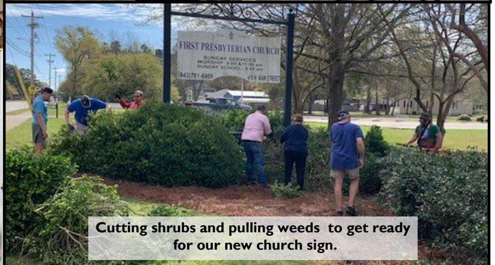
Cutting shrubs and pulling weeds to get ready for our new church sign.