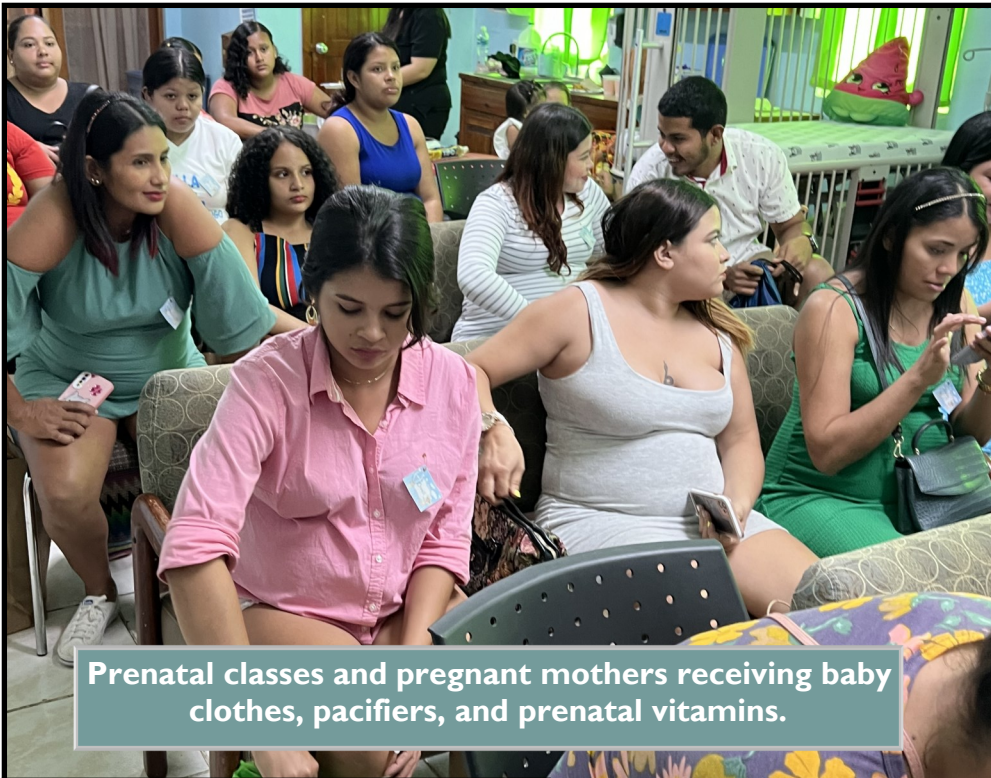
Prenatal classes and pregnant mothers receiving baby clothes, pacifiers, and prenatal vitamins.