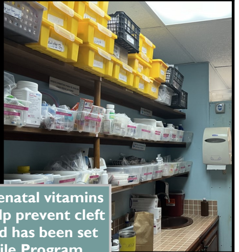
Donations of prenatal vitamins and folic acid help prevent cleft pallet. This child has been set up for the Smile Program.