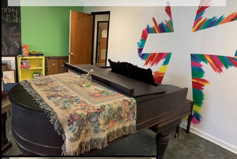
Moved the large piano into the new choir room.