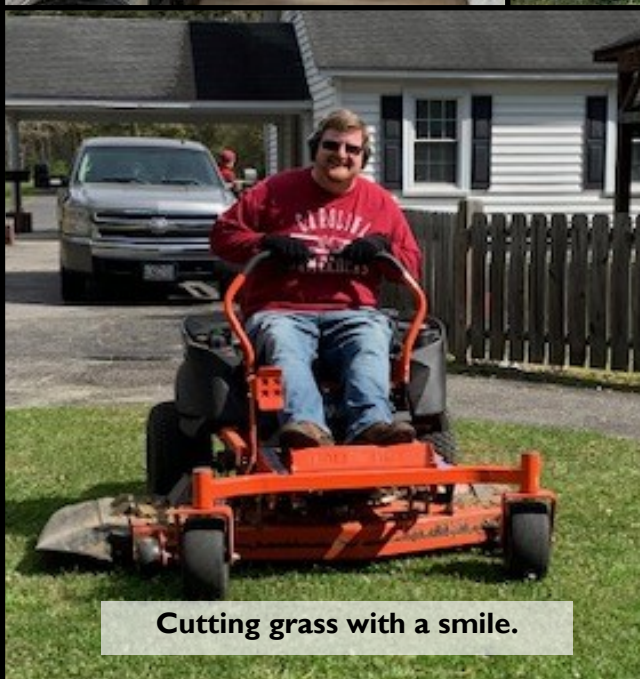
Cutting grass with a smile.