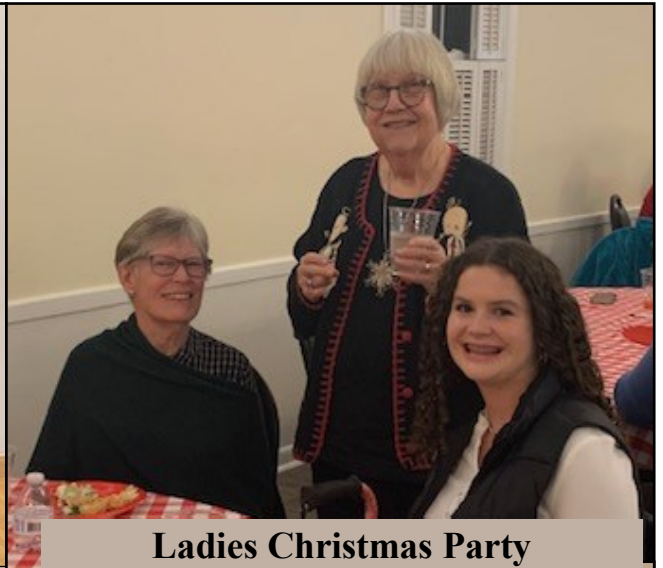
Ladies Christmas Party