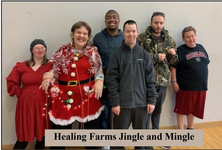
Healing Farms Jingle and Mingle