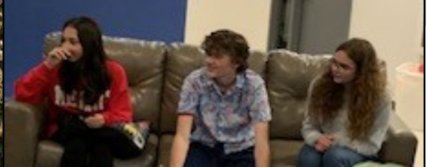
Youth Christmas Party