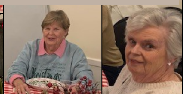
Ladies Christmas Party