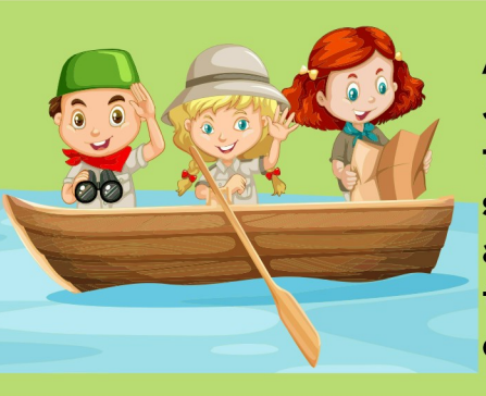
As they "Join the Journey" and seek to follow Jesus themselves, they will see and be encouraged that Jesus is with them every step of the way.

By reading the stories of Peter our children will discover that discipleship (following Jesus) is a journey with twists and turns, and ups and downs.