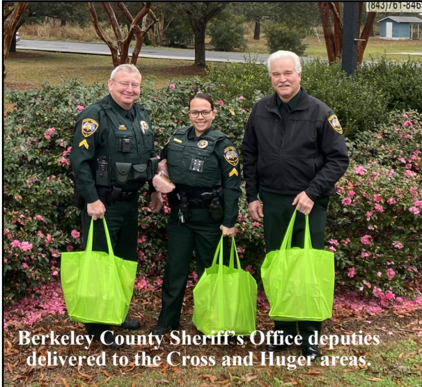
Berkeley County Sheriff's Office deputies delivered to the Cross and Huger areas.