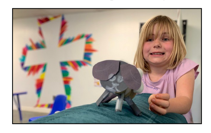
Below is LOGOS end of the year fun.

LOGOS children read the parable of the lost sheep and lost son. They made the connection that they have been the one sheep Jesus sought.