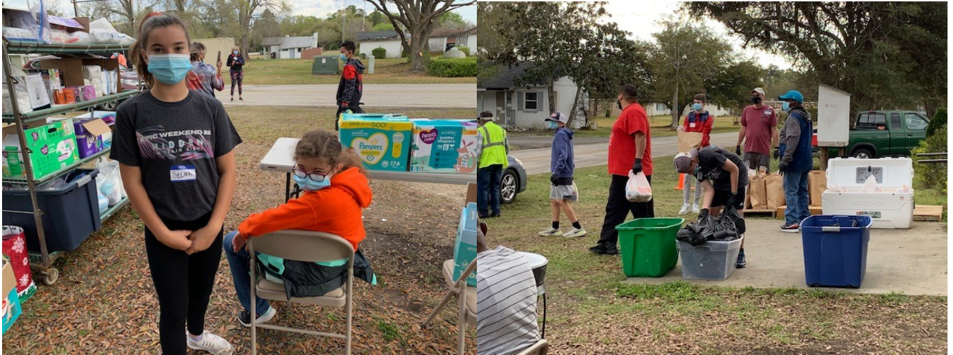
We partnered with Community Hope Impact Center to distribute food and diapers.