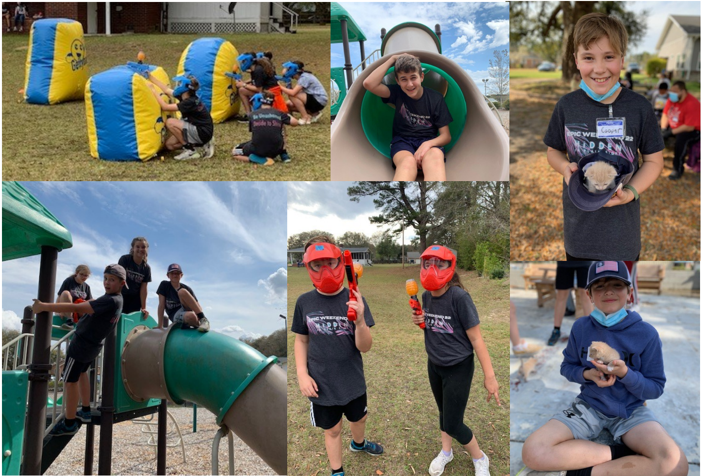
We gathered with other local congregations to worship, serve, and play!