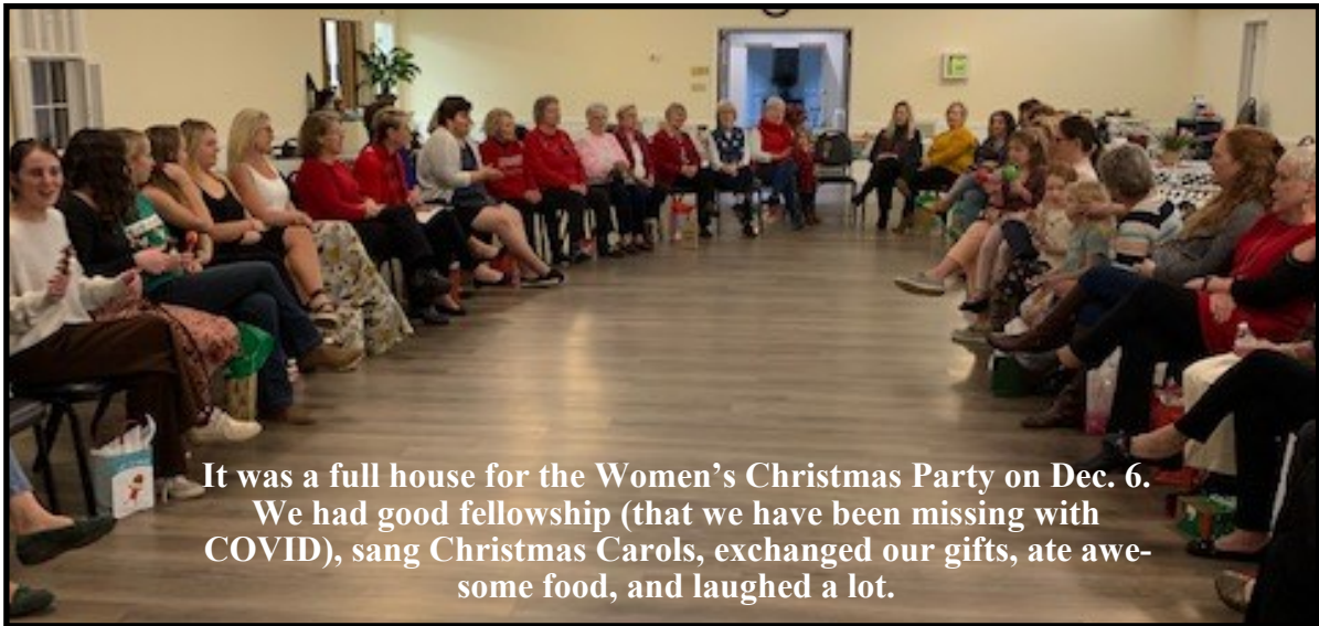
It was a full house for the Women’s Christmas Party on Dec. 6. We had good fellowship (that we have been missing with COVID), sang Christmas Carols, exchanged our gifts, ate awesome food, and laughed a lot.

Our Mission: Making disciples of the next generation who reach UP to God, IN to one another, and OUT to the world!