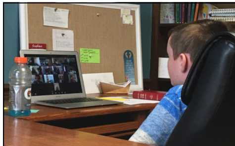
Zoom meeting for a lesson on prayer (Worship), our current way of gathering. These students are faithful and adaptable, eager to learn and grow!